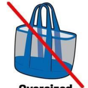
Oversized Clear Tote Bags