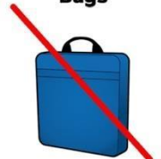
Seat Cushions With Zippers, Pockets or Any Concealable Areas

RESPECT RESPECT THE GAME. RESPECT EACH OTHER.