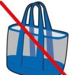
Oversized Clear Tote Bags