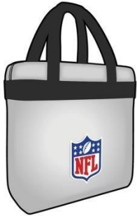
CLEAR PLASTIC BAG 12" x 6" x 12" (or smaller)