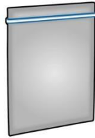
STANDARD 1 GALLON DISPOSABLE FREEZER BAG