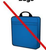
Seat Cushions With Zippers, Pockets or Any Concealable Areas

RESPECT RESPECT THE GAME. RESPECT EACH OTHER.